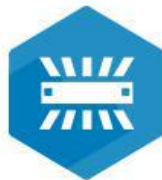
Intelligent Multi-View Scanning