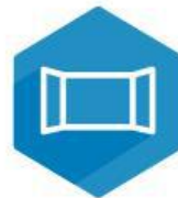
Open & Spacious