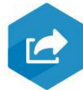
Open STL Format