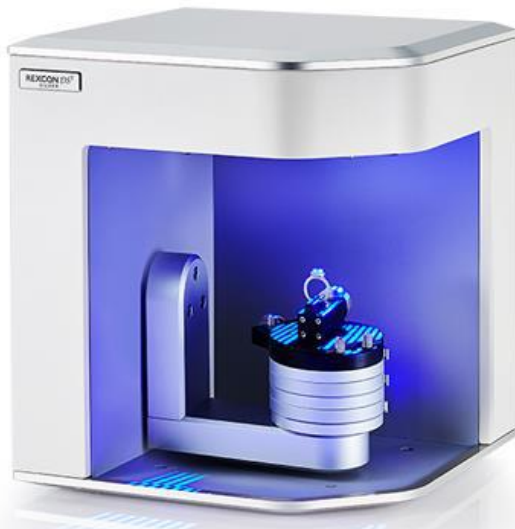
REXCAN SILVER 1.3 MEGAPIXELS